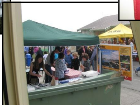
Some photos from 2010 of Paddy's Mart